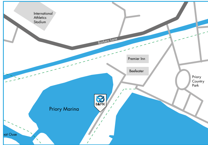
For illustrative purposes only – not to scale.

Priory Marina: Priory Country Park, Bedford MK41 9DJ. Signed car parking spaces are near the Premier Inn/Beefeater. Walk to the Marina to find the John Bunyan at her mooring.